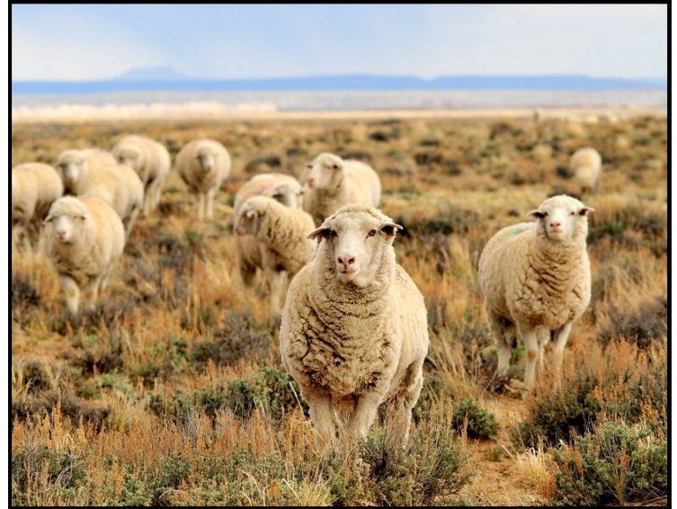
Domestic sheep are immune to the same diseases that can quickly kill large populations of bighorn sheep 10.

While domestic sheep have evolved resistance to diseases like bacterial pneumonia, bighorn sheep have not. 10 This makes bighorn sheep highly susceptible to disease and death following direct contact with domestic sheep. Experiments have indicated up to a 90% mortality rate in bighorn sheep populations within two months of exposure to domestic sheep. 11