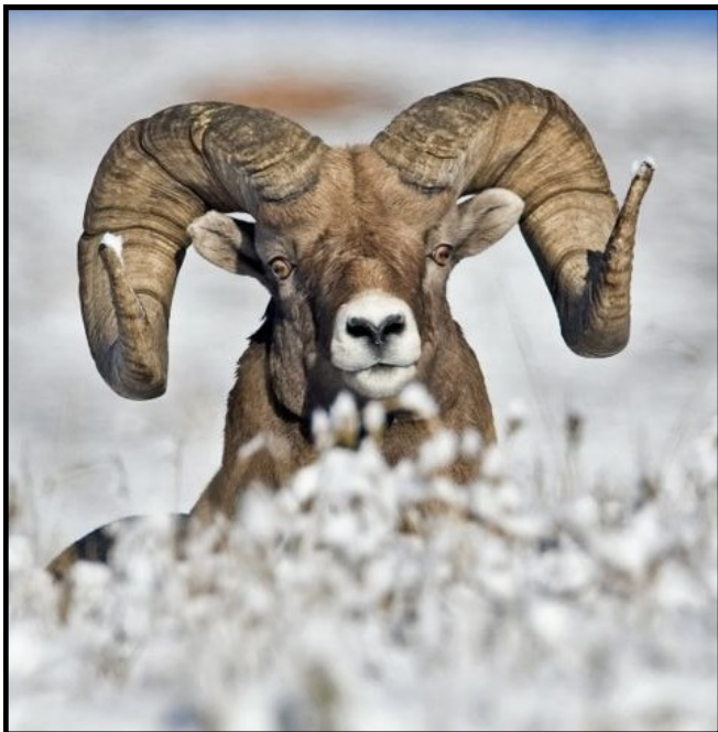
Some subspecies & distinct population segments of bighorn sheep are federally listed as endangered species.

Bighorn sheep evolved in North America thousands of years before the introduction of domestic sheep by European settlers. The domestic sheep brought novel diseases to which native sheep had never evolved a resistance. Moreover, bighorn sheep venture widely in search of resources and other herds, thereby increasing contact with domestic sheep and facilitating the spread of disease. 2