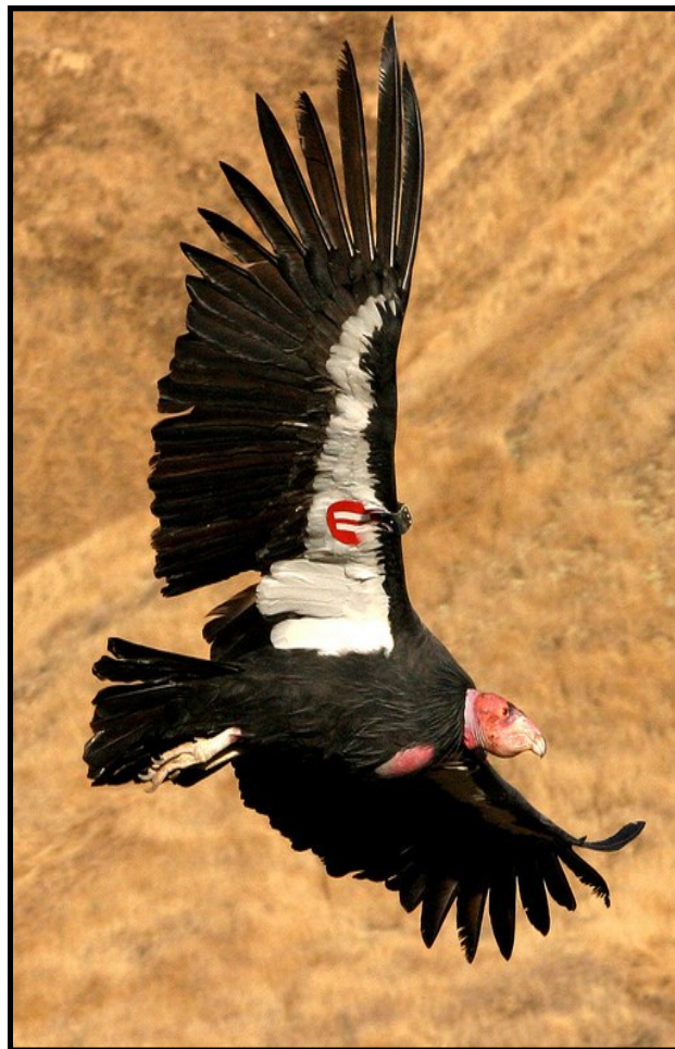
For some species, like the federally endangered California condor, lead exposure has population-level effects that threaten the long-term viability of the species 4.