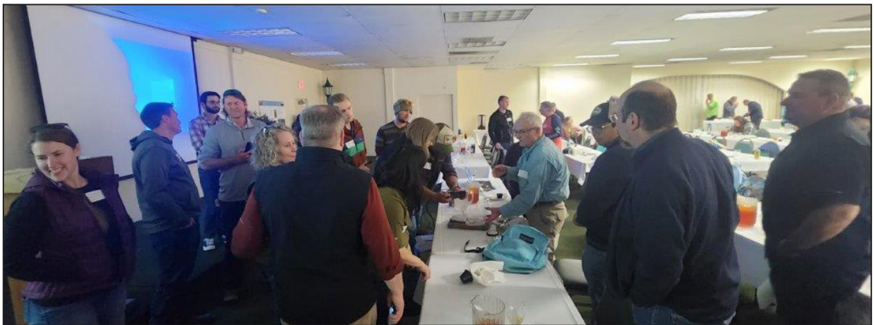
Legless Lizard ( Anniella sp.) viewing and display table.